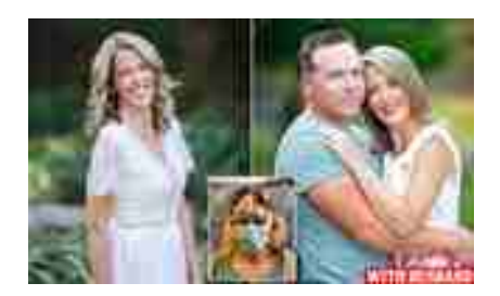
I died and was sent back from heaven to deliver an urgent message